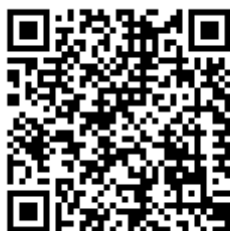
QR Code: Instructions for issuance of COVID-19 certificate by Department of Disease Control